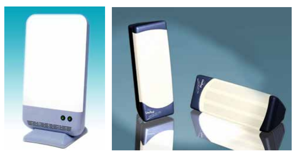
Figure 10: The Diamond Litebox and LitePod light boxes.<sup>68</sup>

her enormous credit because of her sceptical stance.<sup>69</sup> So every knowledgeable scientific sceptic has pretty much been persuaded and I think it's a sad indictment that science does not dictate policy.