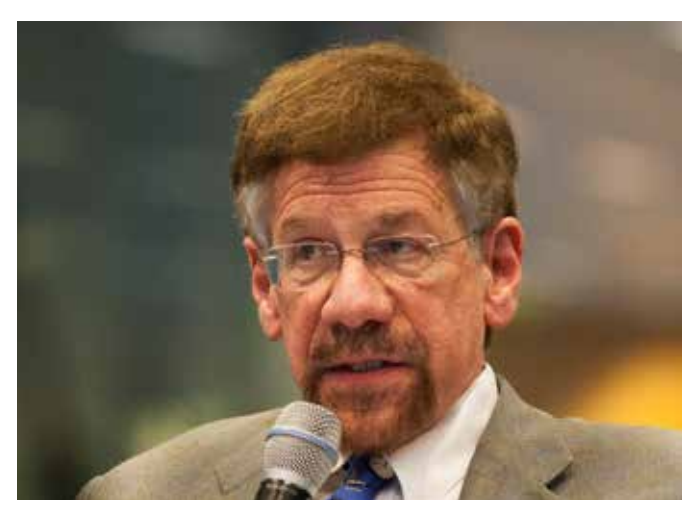
Figure 4: Professor Alfred Lewy